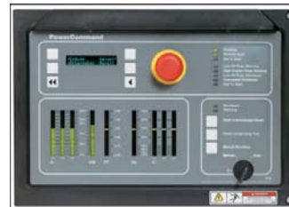
PowerCommand 2100 control operator/display panel