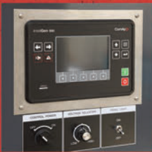
Parallelling Control Panel