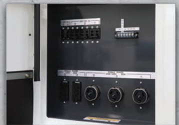
2 | Single-Phase Receptacles 120V - 20A x 2 | 240V - 50A x 3