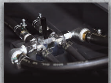
9 | External Fuel Tank Connections with 3-Way Selection Valve

BEST-IN-CLASS dBA RATING // 24-HOUR RUNTIME // WIDEST VOLTAGE RANGE THE INDUSTRY'S HIGHEST-QUALITY MOBILE GENERATORS