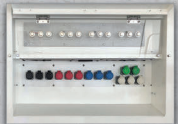
3 | Three-Phase Output Panel Optional Triple Row Cam-Locks™ Shown