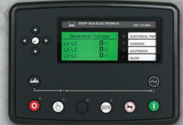
1 | DSEgenset® Digital Control Panel Model 7310 MKII