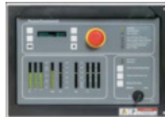
PowerCommand 2100 control operator/display panel