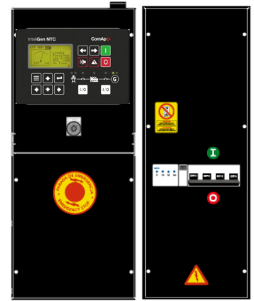
1200 AMP DISTRIBUTION PANEL

Alternator alarms included: Overload, unbalanced voltage, over voltage, under voltage, over frequency, under frequency, short circuit, reverse power, and incorrect phase sequence.