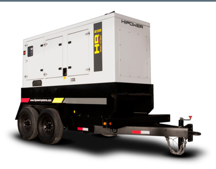
Photo depicts a typical model but may not include options such as trailer.