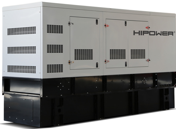
Generator depicted with sound attenuated option, some accessories for display only.