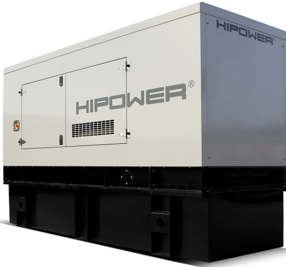
Generator depicted with sound attenuated option, some accessories for display only.