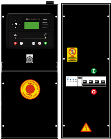
Pictures of Control Panel RH and Distribution Panel LH may include optional equipment and/or accessories

Alternator alarms included: Overload, unbalanced voltage, over voltage, under voltage, over frequency, under frequency, short circuit, reverse power, and incorrect phase sequence.