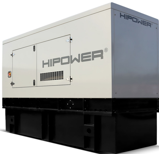
Generator depicted with sound attenuated option, some accessories for display only.