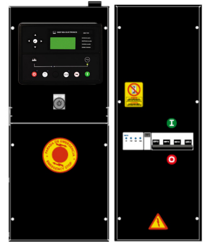
Pictures of Control Panel RH and Distribution Panel LH may include optional equipment and/or accessories

Alternator alarms included: Overload, unbalanced voltage, over voltage, under voltage, over frequency, under frequency, short circuit, reverse power, and incorrect phase sequence.