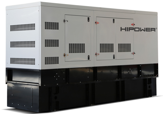
Generator depicted with sound attenuated option, some accessories for display only.