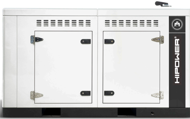
Photo depicts a typical model but may include optional accessories.