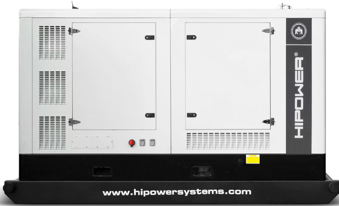
Photo depicts a typical model but may include optional accessories.