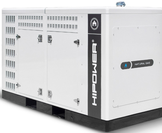
Photo depicts a typical model but may include optional accessories.