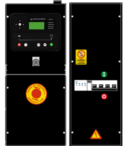
Pictures of Control Module LH and Control Panel RH may include optional equipment and/or accessories

The DSE 7310 digital microprocessor control module continuously monitors the status of the engine and generator and allows programming in the field. It includes Stop-Manual-Auto modes with LED indicators and test buttons for stop/ reset, manual, auto and start modes. Two dry contacts are included for additional auto start function. A tamper-proof hour meter is also supplied.