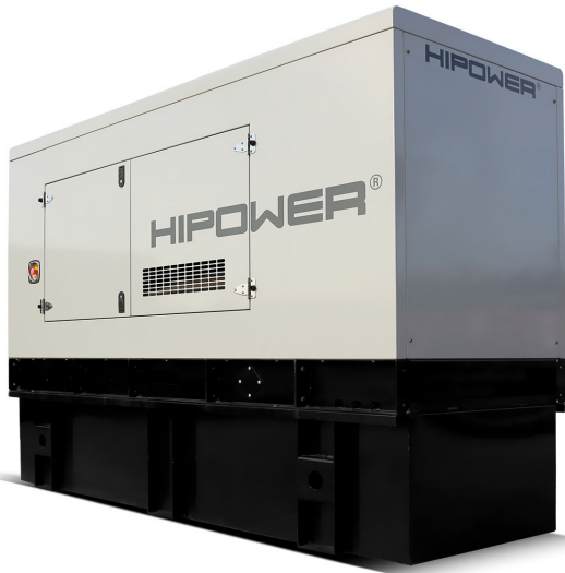
Generator depicted with sound attenuated option, some accessories for display only.