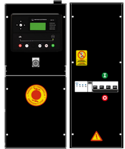
Pictures of Control Panel RH and Distribution Panel LH may include optional equipment and/or accessories

Alternator alarms included: Overload, unbalanced voltage, over voltage, under voltage, over frequency, under frequency, short circuit, reverse power, and incorrect phase sequence.