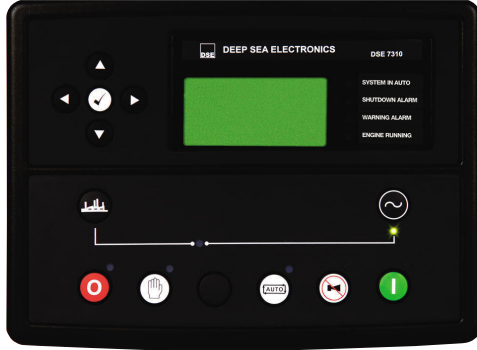
Pictures of Control Panel RH and Distribution Panel LH may include optional equipment and/or accessories